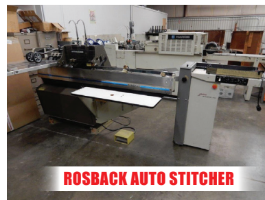
ROSBACK AUTO STITCHER