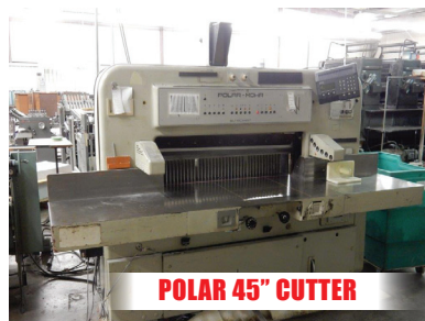
POLAR 45" CUTTER