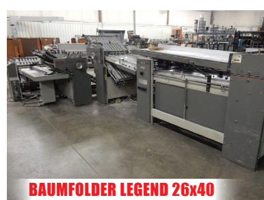
BAUMFOLDER LEGEND 26x40