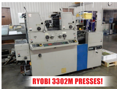
RYOBI 3302M PRESSES!