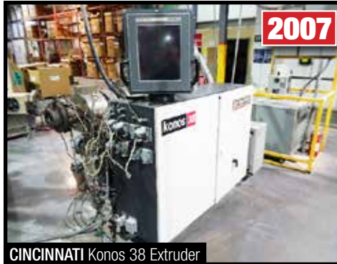
CINCINNATI Konos 38 Extruder