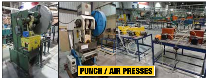
PUNCH / AIR PRESSES