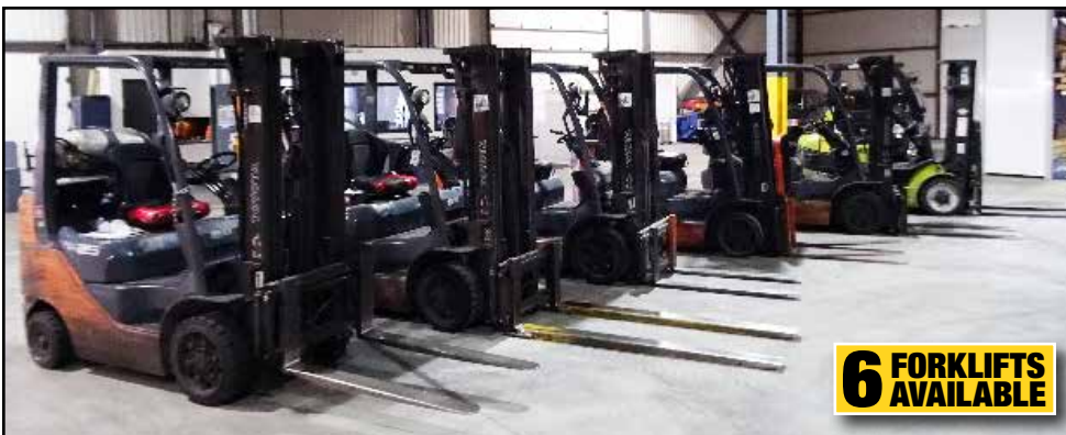
6 FORKLIFTS AVAILABLE