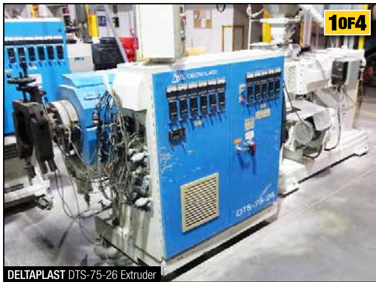
DELTAPLAST DTS-75-26 Extruder