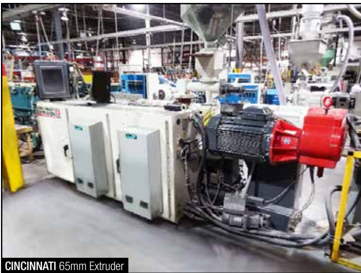
CINCINNATI 65mm Extruder