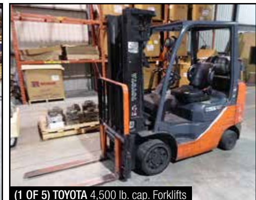
(1 OF 5) TOYOTA 4,500 lb. cap. Forklifts