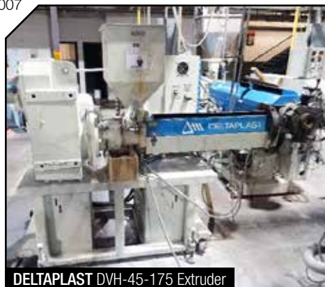
DELTAPLAST DVH-45-175 Extruder