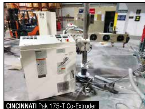
CINCINNATI Pak 175-T Co-Extruder