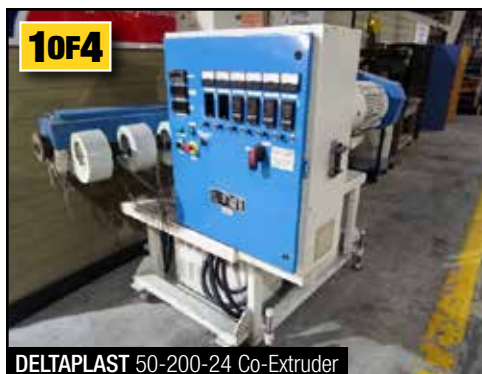
DELTAPLAST 50-200-24 Co-Extruder