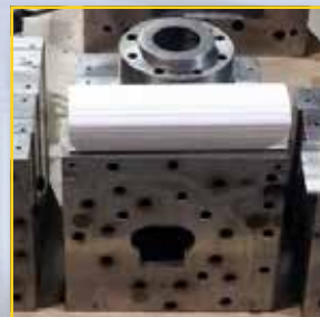
DYE 3052 Premium Colonial Top Rail