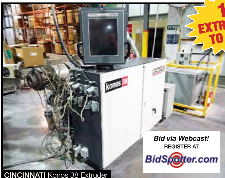
CINCINNATI Konos 38 Extruder