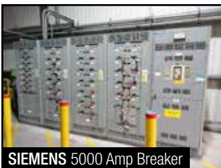
SIEMENS 5000 Amp Breaker