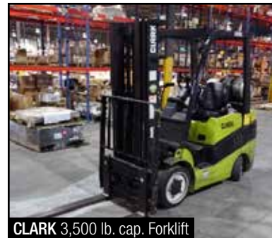
CLARK 3,500 lb. cap. Forklift