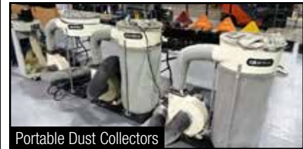
Portable Dust Collectors