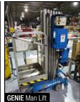
GENIE Man Lift