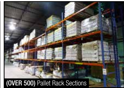
(OVER 500) Pallet Rack Sections