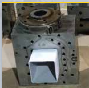
DYE 3025 & 3028 Heavy Wall Square Post 5x5 & 4x4 (96")