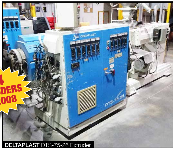
DELTAPLAST DTS-75-26 Extruder