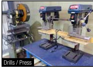
Drills / Press