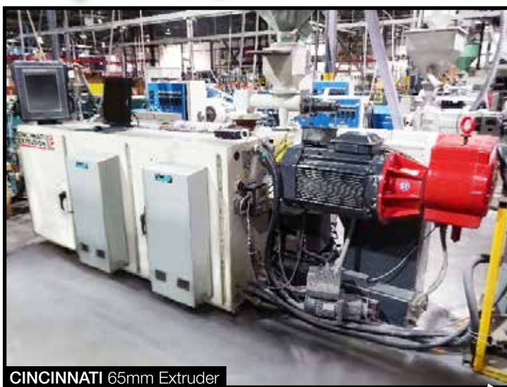
CINCINNATI 65mm Extruder