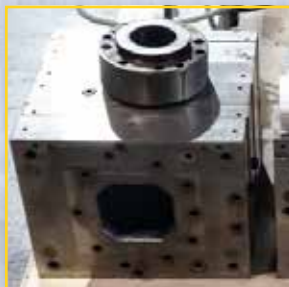
DYE 3044 Octagonal Post

COMPLETE CATALOGUE AVAILABLE AT WWW.MAYNARDS.COM