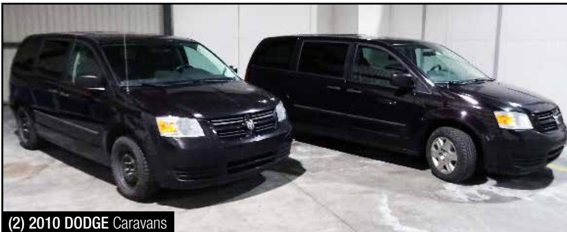
(2) 2010 DODGE Caravans