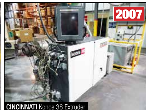
CINCINNATI Konos 38 Extruder