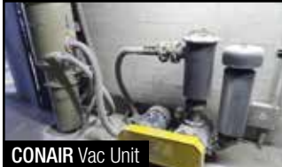
CONAIR Vac Unit