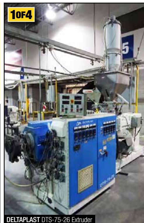
DELTAPLAST DTS-75-26 Extruder