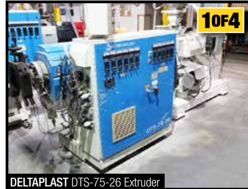
DELTAPLAST DTS-75-26 Extruder