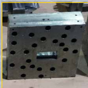
DYE 3041 Rail for Classic Railing