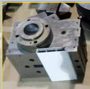
DYE 3053 Planks for Madison, Richmond & Oxford