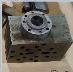
DYE 3042D Picket for Classic Railing