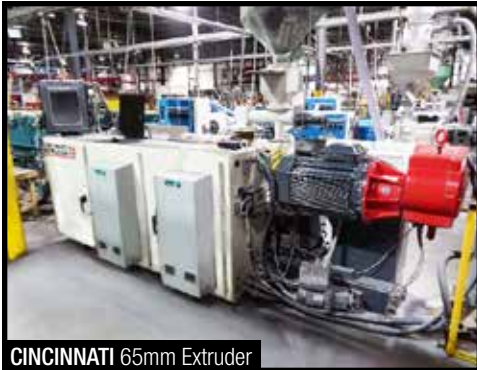
CINCINNATI 65mm Extruder

160,000 SQ. FT. PRODUCTION / WAREHOUSE FACILITY