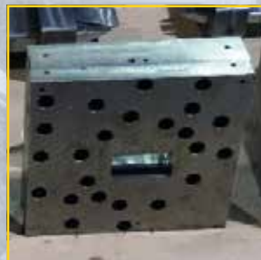
DYE 3041A Premium Colonial Bottom Rail