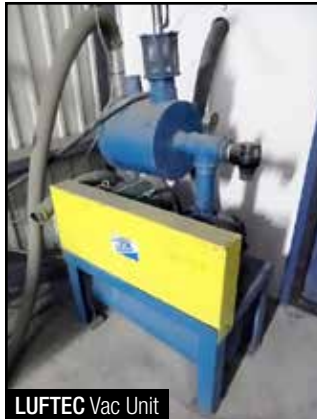
LUFTEC Vac Unit