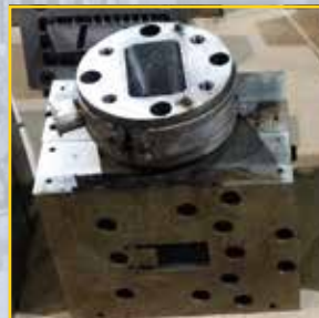
DYE 3043A Rail for Madison, Richmond & Oxford