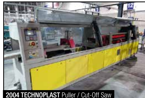
2004 TECHNOPLAST Puller / Cut-Off Saw