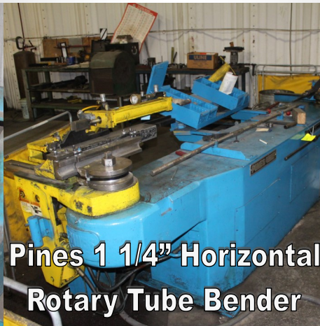
Pines 1 1/4" Horizontal Rotary Tube Bender