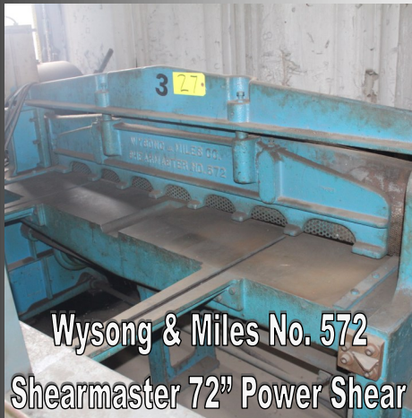
Wysong & Miles No. 572 Shearmaster 72" Power Shear