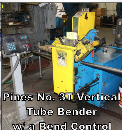
Pines No. 3T Vertical Tube Bender w/ a Bend Control