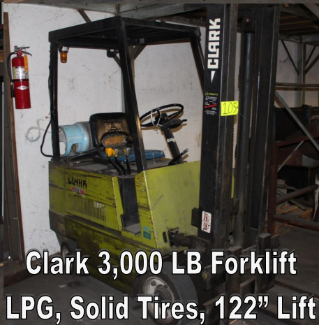
Clark 3,000 LB Forklift LPG, Solid Tires, 122" Lift