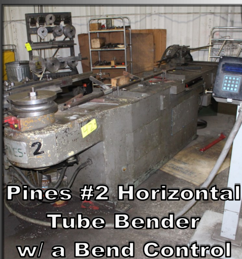
Pines #2 Horizontal Tube Bender w/ a Bend Control

Fabrication Equipment, Powder Coating Lines, Forklifts, Tons of Suplus Inventory and More!