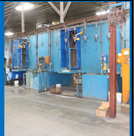
3-Stage Thru Feed Washer, Gas Fired Stage 1 Burner Overhead Monorail Fed, Est. 60' Length