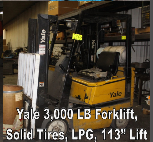
Yale 3,000 LB Forklift, Solid Tires, LPG, 113" Lift