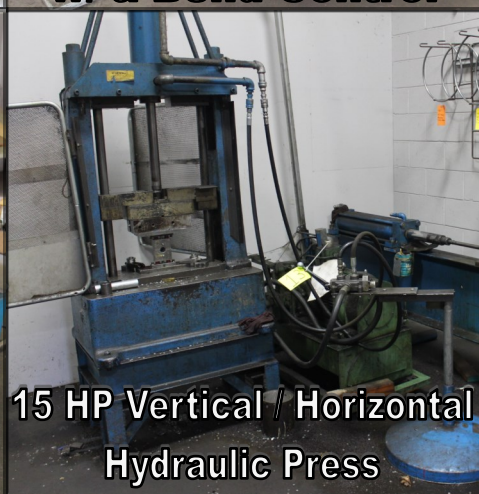
15 HP Vertical / Horizontal Hydraulic Press