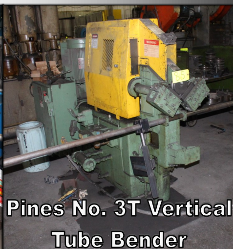
Pines No. 3T Vertical Tube Bender