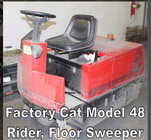
Factory Cat Model 48 Rider, Floor Sweeper

Pines #2 Horizontal Tube Bender, Pines #3 Vertical Tube Bender, Minster 60 Ton OBI Press, Iontech Powder Coat Booth, 3-Stage Thru Washer, Overhead Monorail, Gas Fired Dry Off Oven, Quincy Air Compressor, Forklifts, Swagging Machine, Punch Press, Fabricated Steel Racking, OBI Presses, Niagara Straight Side Press, Radial Arm Saw, Miller Welder & Power Supply, Concrete Mixer, Modern Cut-Off Machines, Belt Sander, Bench Top Drill Press, Bandsaw, Vertical Milling Machine, Bench Grinder, Parts Washer, Power Shear, Steel Tables, Workbenches, Self Dumping Hoppers, Assorted Tools, Surplus Inventory and MORE!