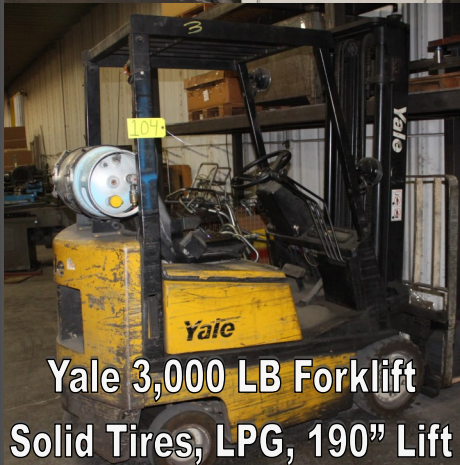
Yale 3,000 LB Forklift Solid Tires, LPG, 190" Lift