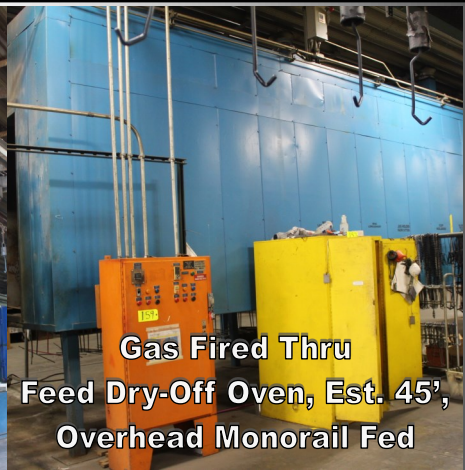
Gas Fired Thru Feed Dry-Off Oven, Est. 45', Overhead Monorail Fed