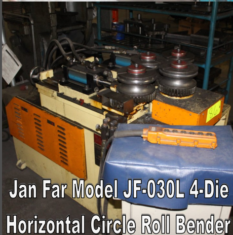
Jan Far Model JF-030L 4-Die Horizontal Circle Roll Bender