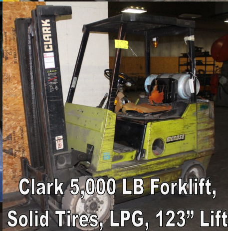
Clark 5,000 LB Forklift, Solid Tires, LPG, 123" Lift