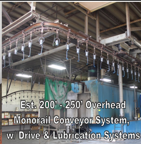
Est. 200' - 250' Overhead Monorail Conveyor System, w/ Drive & Lubrication Systems