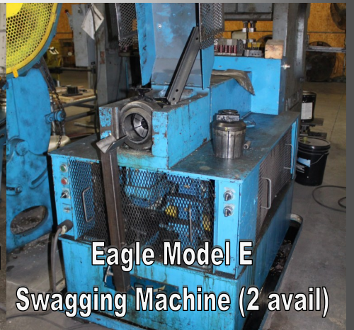
Eagle Model E Swagging Machine (2 avail)