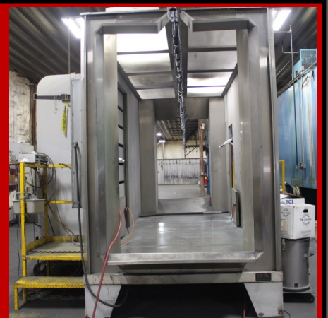
Iontech Thru Feed Powder Coat Application Booth, Overhead Monorail Fed, Stainless Steel, Hand Held Applicator Guns, Color Powder Pots

Sign on to BIDSPOTTER to review complete catalogue of auction