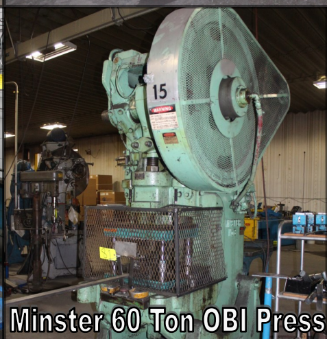
Minster 60 Ton OBI Press

Sign on to BIDSPOTTER to review complete catalogue of auction