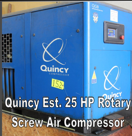
Quincy Est. 25 HP Rotary Screw Air Compressor